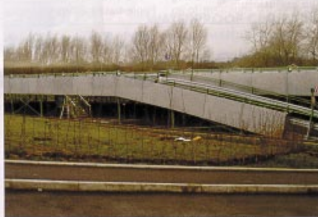
The new deck at Chorley & South Ribble Hospital

Chorley & South Ribble District General Hospital is increasing its parking capacity by use of a pre-fabricated modular car park deck. The trust reviewed its parking requirements and concluded it needed to provide a 220-space car park. The available land was an unmade, undulating, terraced, greenfield site. The Trust decided to install a Fast Park deck. The completed car park was opened to public, staff, patients and visitors after just three months' work. www.fastpark.com